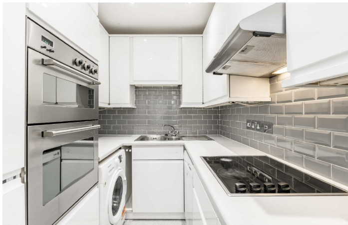
Carrington Street, W1J