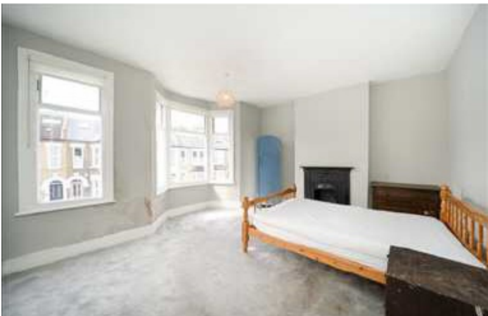
Fernbrook Road, SE13