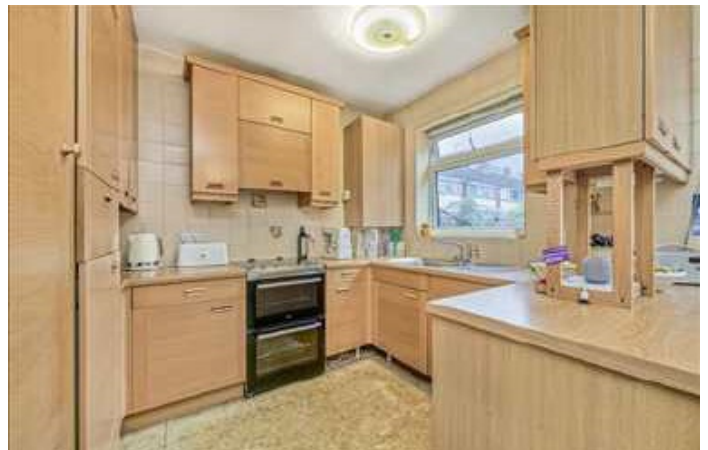
Lyme Farm Road, SE12