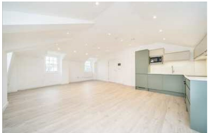
Deptford High Street, SE8