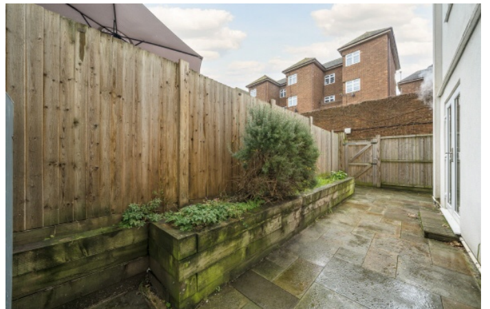
Trafalgar Grove, SE10