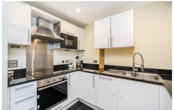
Merryweather Place, SE10