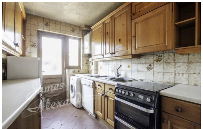
Grove Road, CR7