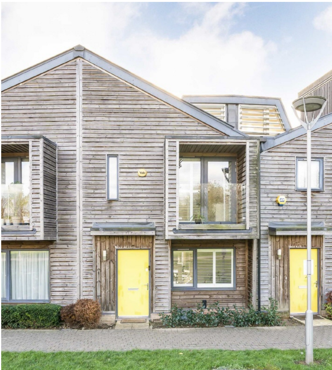
Tomblin Mews, SW16 £500,000