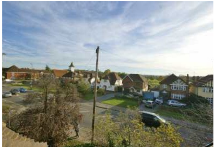
Flat 14 Oakdene Court, Cobham, KT11 1GA £1,600 PCM Leasehold